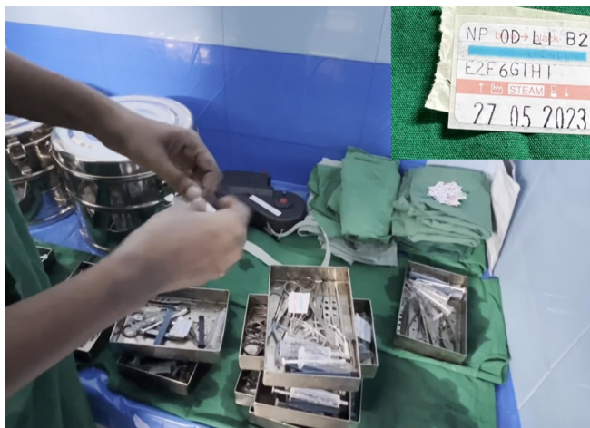
REUSING SUPPLIES. Surgical instruments are prepared to be sterilized using short-cycle autoclave at Aravind Eye Hospital, in Pondicherry, India.